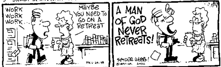
5 th SUNDAY IN ORDINARY TIME

8:00 AM - 11:30 AM RCIA in Church/Social Hall/School 13, 4-5 8:30 AM & 10:30 AM MQH Masses 11:30 AM - 1:30 PM Fellowship after 10:30 Mass in Barrett Hall 2:00 PM - 3:00 PM Baptisms in Church