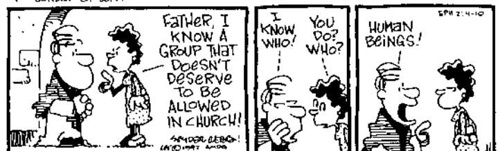
4 th SUNDAY OF LENT

8:00 AM - 11:30 AM RCIA in Church/Social Hall/School 13, 4-5 8:30 AM & 10:30 AM MQH Masses Bread for the World Letters in Barrett Hall after Mass