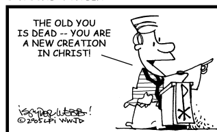
5TH SUNDAY IN LENT

7:45 AM - 12:00 PM RCIA in Classrooms 4-5/11-12/13 8:30 AM & 10:30 AM MQH Mass in Church Fellowship after 10:30 Mass in Barrett Hall 9:30 AM - 2:00 PM RCIA Retreat in Social Hall/School 2:00 PM - 3:00 PM Baptisms in Church