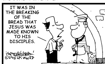
3RD SUNDAY IN EASTER