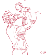
Father's Day Día del padre