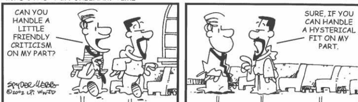
23RD SUNDAY IN ORDINARY TIME

In order to experience the new and abundant life offered by Jesus, we must love our neighbor as our self. One factor that makes this hard to do is risks. The risk entailed involves the possibility of being hurt by another person. We need not fear, though, because God will give us the grace to forgive, heal and overcome.