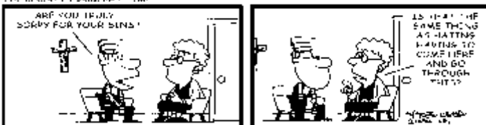
THE GUNNER'S PUNISHMENT TIME