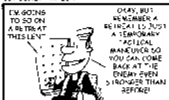
151 SUNDAY OF LENT