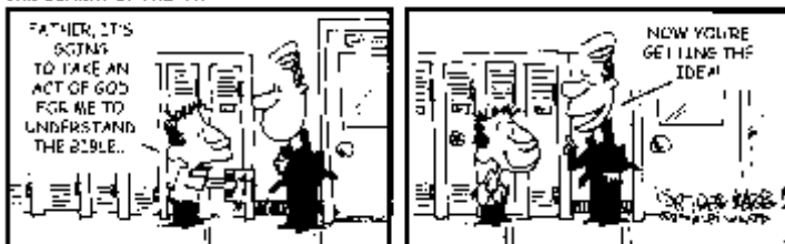
3RD SUNDAY OF EASTER