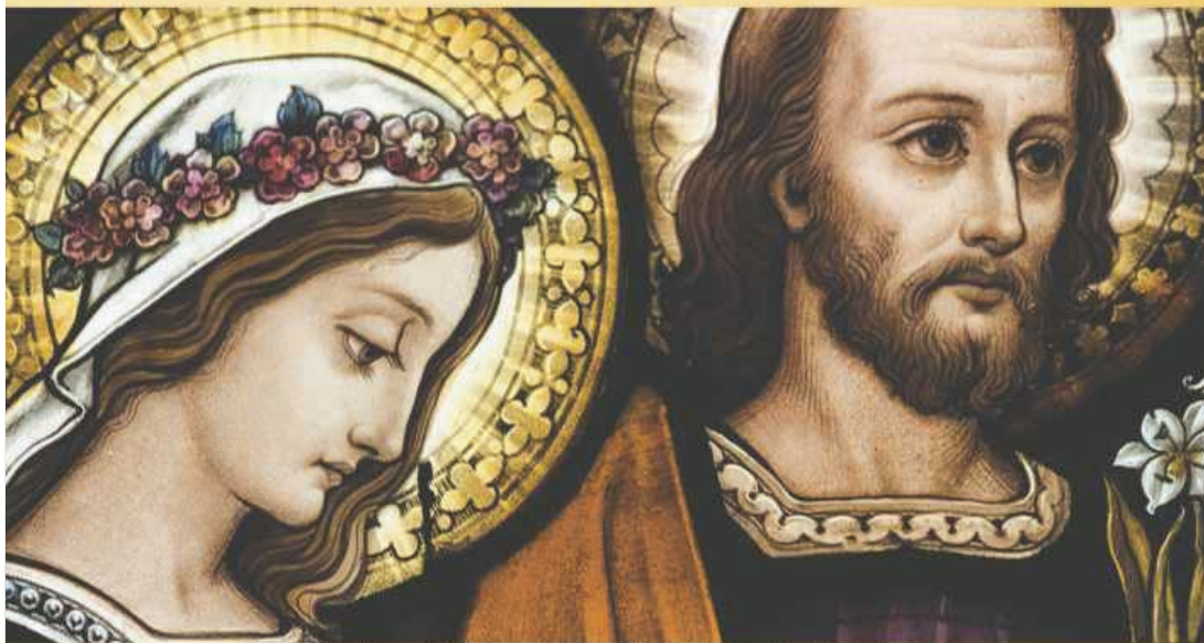
Cover design ©Liturgical Publications Inc.