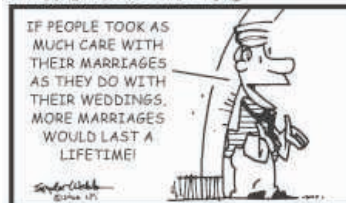
27th SUNDAY IN ORDINARY TIME

For more information on any of the above, please contact the REO, (630) 832-8962 or email at mqhmadwoods@sbcglobal.net .