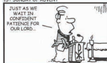
1ST SUNDAY OF ADVENT