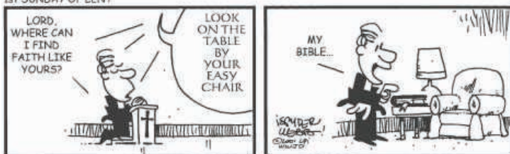
1st SUNDAY OF LENT