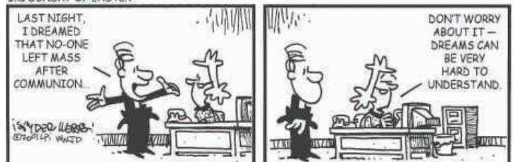
2nd SUNDAY OF EASTER

8:30 a.m. & 10:30 a.m. MQH Mass 10:30 a.m. - 11:30 a.m. Children's Liturgy of the Word in Room 2-3