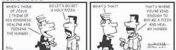
3RD SUNDAY OF EASTER

8:30 a.m. & 10:30 a.m. MQH Mass 9:00 a.m. - 10:30 a.m. Youth Group Destiny in Room 1 10:30 a.m. - 11:30 a.m. Children's Liturgy of the Word in Room 2-3 11:30 a.m. - 1:00 p.m. Fellowship in Barrett Hall 2:00 p.m. - 3:00 p.m. Baptisms in Church 6:00 p.m. - 7:30 p.m. Youth Group Wings in Barrett Hall