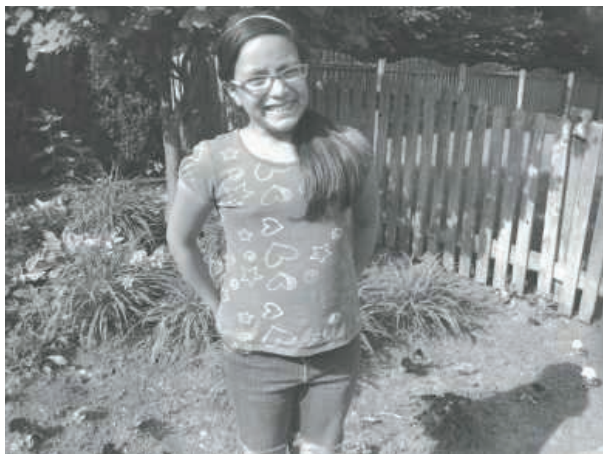
"All Grown Up"

My love to you, precious, in Jesus, Grandpa