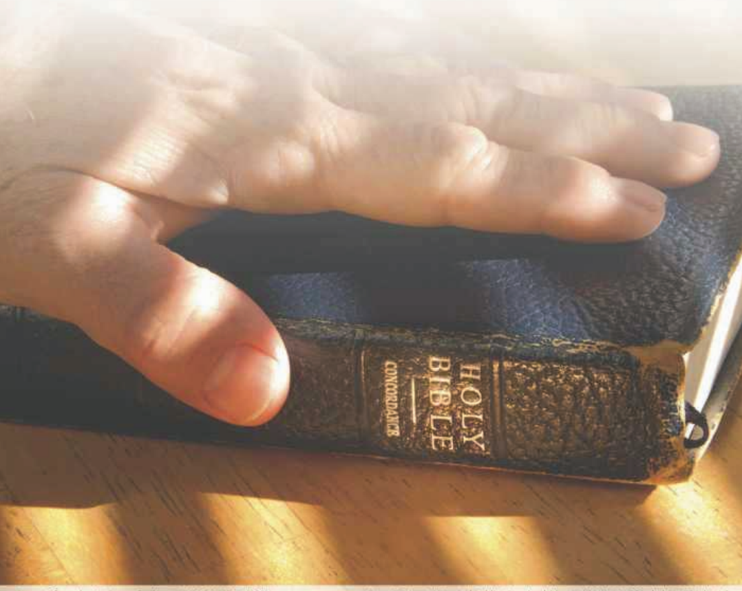
Excerpts from the Lectionary for Mass @ 2001, 1998, 1970 CCD.

"It will lead to your giving testimony. Remember, you are not to prepare your defense beforehand, for I myself shall give you a wisdom in speaking that all your adversaries will be powerless to resist or refute." — Lk 21:13-15