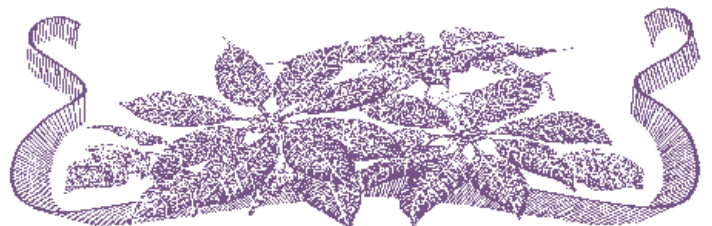
2 nd SUNDAY OF ADVENT

New Year's Eve, December 31 - 4:30 p.m. New Year's Day, January 1, 2013 - 9:00 a.m.