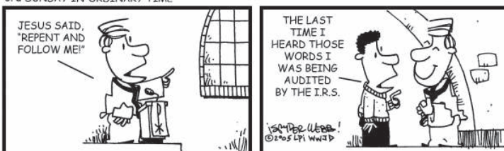
3rd SUNDAY IN ORDINARY TIME