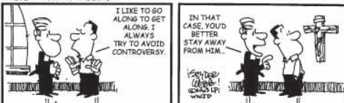
PRESENTATION OF THE LORD

Email debbie@styka.com or call (630) 941-7224