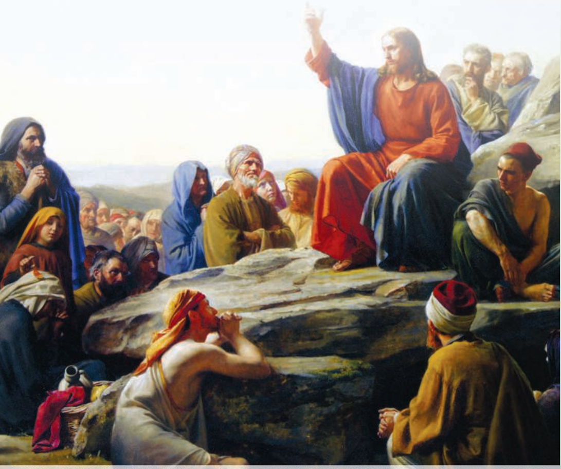
Excerpts from the Lectionary for Mass © 2001, 1998, 1970 CCD.

"You have heard that it was said, An eye for an eye and a tooth for a tooth. But I say to you, offer no resistance to one who is evil. When someone strikes you on your right cheek, turn the other one as well." — Mt 5:38-39