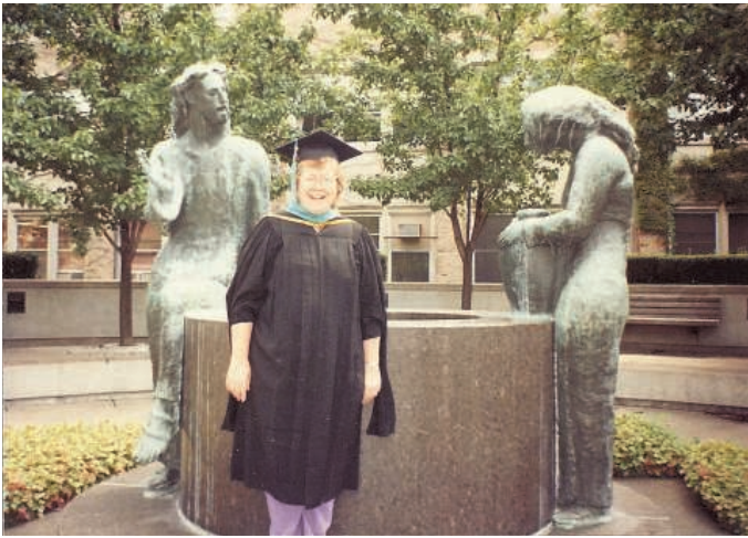
Graduation day at Notre Dame