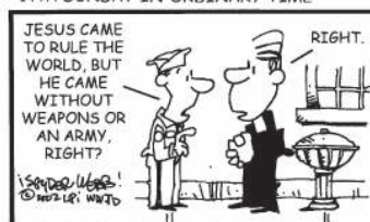
14TH SUNDAY IN ORDINARY TIME