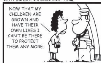
16TH SUNDAY IN ORDINARY TIME