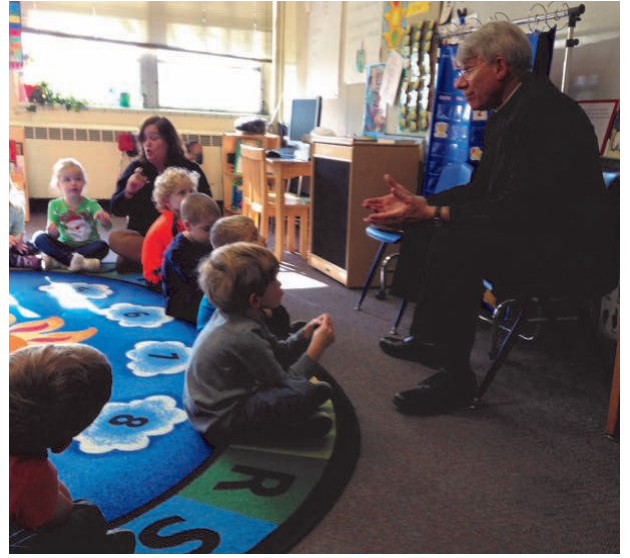
Saint Nicholas Celebration and Preschool