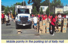
Mobile pantry in the parking lot of Kelly Hall

This year we are fund raising to provide healthy after school snacks for the hundreds of children who attend the Mission of Our Lady of the Angels after school program in West Humboldt Park, one of the poorest neighborhoods in the City of Chicago.