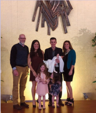
November 6, 2016: