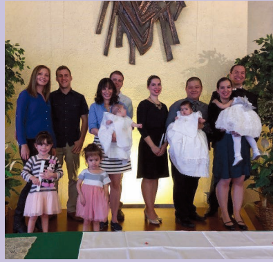
November 20, 2016: