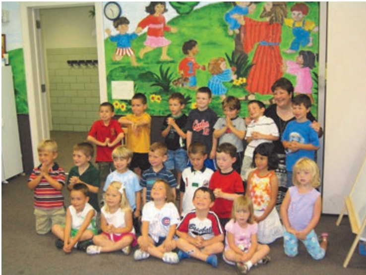
With some of the preschool children!