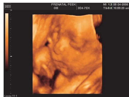
My third grandchild — a grandson due to be born in August!