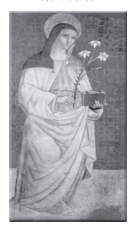
Also, join us Tuesday, October 14, 2008, 7:00 pm for the next in the series of Women in the Bible and the Church Women of the New Testament

For further information, contact the Church office at 630-279-5700.