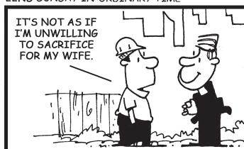
22ND SUNDAY IN ORDINARY TIME