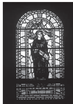
PHOEBE of Cenchrae

Wednesday, October 15, 2008, 7p.m. in Church