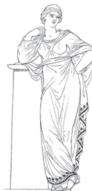
Lydia - First European convert