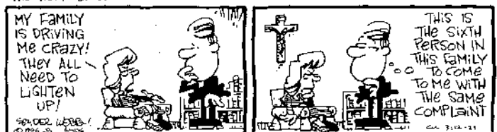
THE HOLY FAMILY